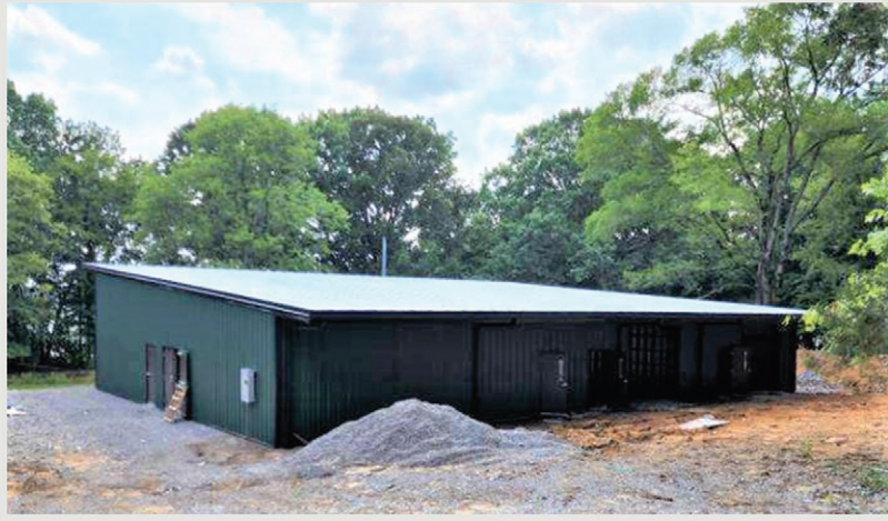
As of July 12, 2022 the building was in place

Construction on the new Roy Grindstaff Skilled Trades Center has continued throughout the summer with its completion anticipated by the end of the year. A ribbon cutting ceremony will take place at time to be determined.