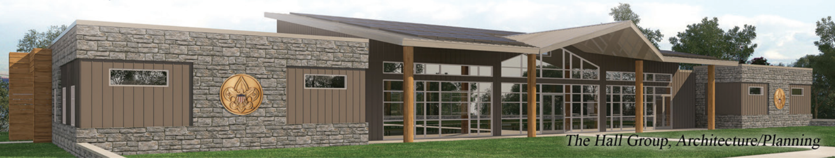
The Hall Group, Architecture/Planning