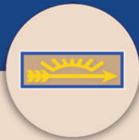
ARROW OF LIGHT Fifth Grade