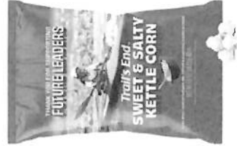
SWEET & SALTY KETTLE CORN $15