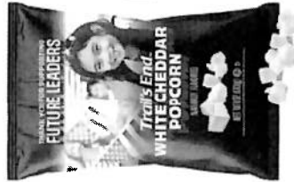
WHITE CHEDDAR POPCORN $25