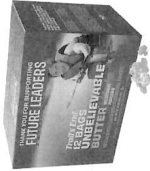
UNBELIEVABLE BUTTER MICROWAVE POPCORN $25