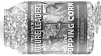
POPPING CORN $20