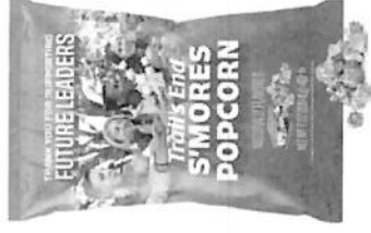
S'MORES POPCORN $25