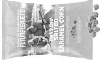
SALTED CARAMEL CORN $25