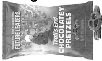
CHOCOLATEY PRETZELS $30