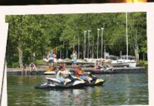
JET SKI PROGRAM